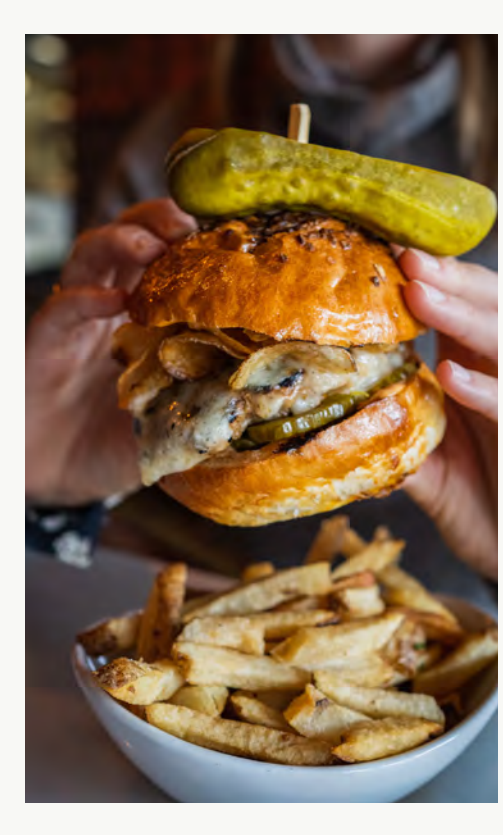
MJ's Cafe Eat at James Hungry Jay's Cafe Urban Eatery Max's Dinner Afaskasi Cafe